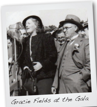
Gracie Fields at the Gala

On Saturday 20th August 1938, one of the VIP's was the famous Gracie Fields. There was also