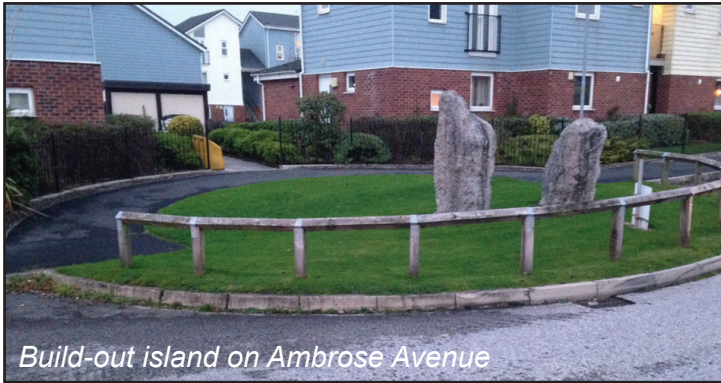
Build-out island on Ambrose Avenue