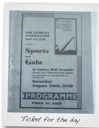
Ticket for the day

The whole event proved to be very popular and was a great success. Such was the interest in the occasion that highlights of the day, especially the performance by Gracie Fields was recorded by Pathe News and now resides in the film archives.